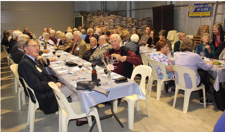
Past members invitation Dinner